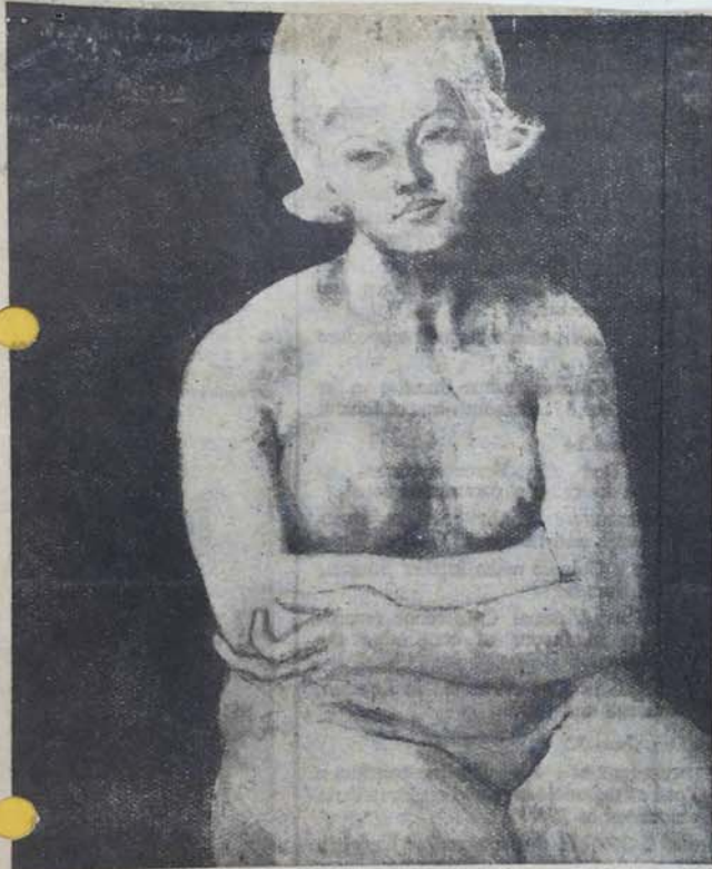
'La Belle Hollandaise', by Picasso, at the Modern Art Gallery