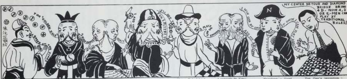
Shih Ch'eng - Mandarin to Hrat, Chinese King (about 1600 B.C.) invented "Chess" and "Wei" (or "Go").