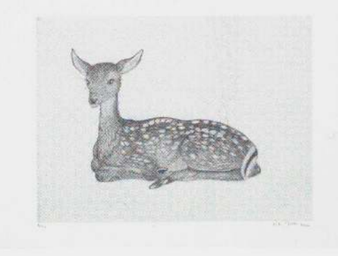
Faum. 2001. Etching and aquatint on mold-made Hahnemühle paper, plate: 18 \times 24^{\circ} ( 45.7 \times 61 cm), sheet: 22 \sqrt{\times} 51^{\circ} ( 57.2 \times 78.7 cm). Publisher and printer: Harlan & Weaver, Inc., New York. Edition: 30.

In the second half of the 1990s the focus of Kiki Smith's printmaking shifted from the human body to the bodies of birds and animals, and to exploring humanity's relationship with other earthly creatures. She often sketched directly from dead and stuffed specimens (some deliberately sought out in natural history museums, some encountered in ordinary life), depicting them isolated on blank backgrounds that directed attention to their form and symbolic resonance rather than to their environment. Her regard for the life of animals was matched by an appreciation of the aesthetic qualities of their forms-their shapes, and the colors and textures of their coats. During this period, Smith began a prolific collaboration with the New York etching workshop of Harlan & Weaver. She found the delicate line attainable with etching ideal for the depiction of feathers and fur.