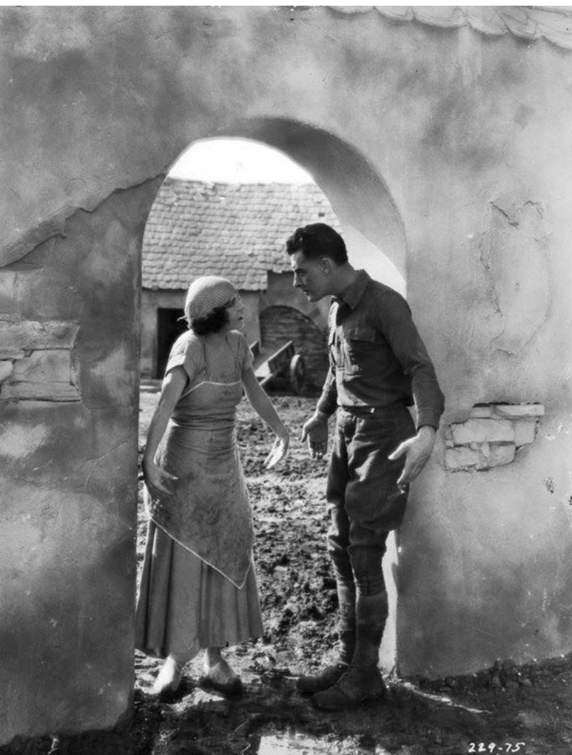
THE BIG PARADE. DIRECTED BY KING VIDOR. 1925. USA. BLACK AND WHITE, SILENT, 151 MINUTES.

to hold all this together and seemingly overnight became the leading “serious” director in America, assuming at thirty-one the mantle that had fallen from D. W. Griffith’s shoulders when the Master was forced to sign a contract with Paramount in 1925. The Big Parade still dwarfs virtually every film made about World War I, and it is arguably Vidor’s finest achievement.