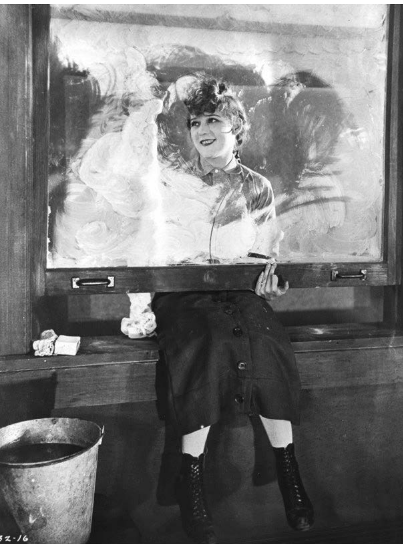
AMARILLY OF CLOTHES-LINE ALLEY. DIRECTED BY MARSHALL NEILAN. 1918. USA. BLACK AND WHITE, SILENT, 67 MINUTES.

Although not as important as John Ford or Howard Hawks, Walsh has an honored place in the history of Westerns. In Old Arizona (1928) is the first talkie shot largely on location, and The Big Trail (1930) is spectacularly inventive in its use of an experimental widescreen process. Walsh worked productively with everyone from Humphrey Bogart to Mae West, and, of course, he discovered John Wayne. Happy endings were not requisite for Walsh, and he even waxed lyrical over the massacre of Custer in They Died with Their Boots On (1941). Walsh was an archetypal example of a studio director who took all kinds of assignments and