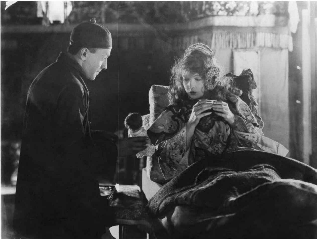
BROKEN BLOSSOMS . DIRECTED BY D. W. GRIFFITH. 1919. USA. BLACK AND WHITE, 90 MINUTES.

multiple facets, it made use of mobile aerial cameras not unlike those now used for television coverage of sporting events, and there is a famous three-screen climax. Intended as the first of a six-part series, the surviving film is a monument to both Gance's vision and its overextension. The original premiere was at the Paris Opera House, and I had the privilege of being present at the Radio City Music Hall screening in 1981 when the aged and ailing Gance called in from Paris.