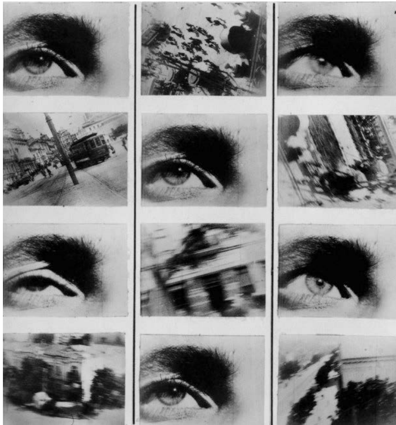
MAN WITH A MOVIE CAMERA. DIRECTED BY DZIGA VERTOV. 1929. SOVIET UNION. BLACK AND WHITE, SILENT, 68 MINUTES.