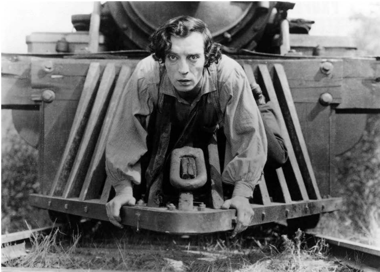
THE GENERAL . DIRECTED BY CLYDE BRUCKMAN AND BUSTER KEATON. 1926. USA. BLACK AND WHITE, SILENT, 67 MINUTES.

While both The General (1927) and the cyclone sequence in Steamboat Bill, Jr. (1928) are, on one level, hysterically funny, the humor is derived from some very dark material – the most grisly war in American history and a world gone meteorologically mad, respectively. It is amusing to see a train plunging off a bridge into a ravine, but it's also a different level of calamity than slipping on a banana peel. What dark ghosts enabled Buster to find amusement in these events, and why do they bring us delight in addition to awe? I believe the answer lies somewhere in Keaton's pursuit of perfection, his desire to put forth a unique vision, his alcoholism, and his surreal view of the world. His great rival, Charlie Chaplin, would find somber humor in the antics of a misogynistic serial killer in Monsieur Verdoux (1947), and Stan Laurel and Oliver Hardy seemed to thrive on the expert application of pain and humiliation.