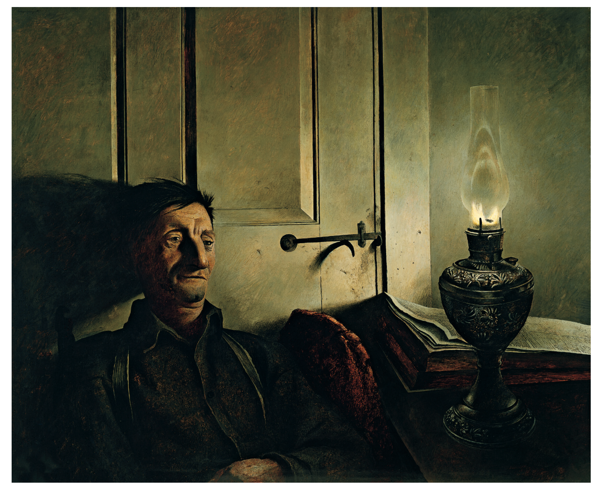
FIG. 8. Andrew Wyeth (American, 1917–2009). Oil Lamp. 1945. Tempera on panel, 34 x 42" (83.4 x 106.7 cm). WYETH COLLECTION