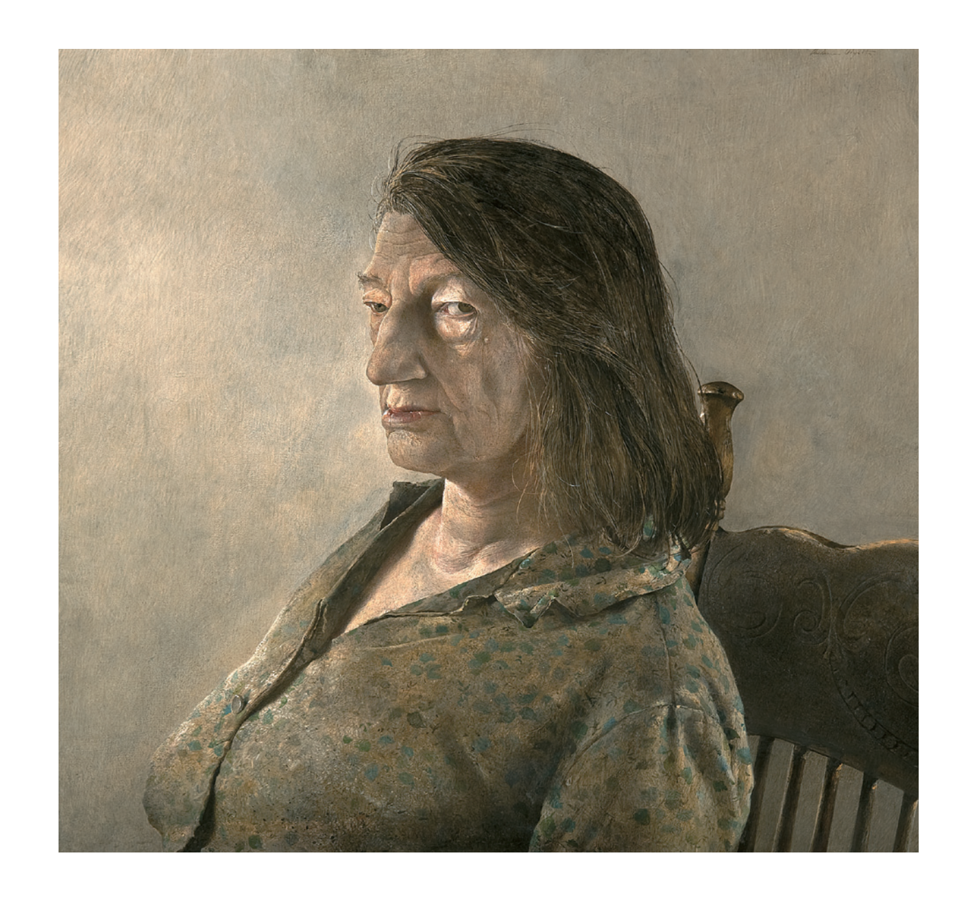
FIG. 11. Andrew Wyeth (American, 1917–2009). Anna Christina . 1967. Tempera on panel, 21½ x 23½" (54 x 59.7 cm). Brandywine river museum, chadds ford, pennsylvania, and museum of fine arts, boston. Anonymous gifts