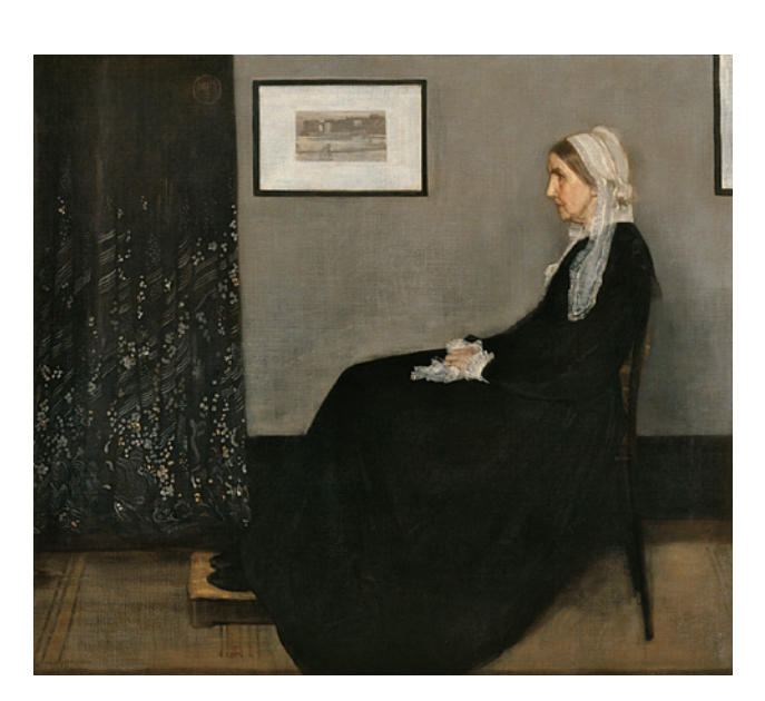
FIG. 1. James Abbott McNeill Whistler (American, 1834–1903). Arrangement in Gray and Black No. 1 (The Artist's Mother). 1871. Oil on canvas, 56^{13} /6 x 64" (144.3 x 162.5 cm). MUSÉE D'ORSAY, PARIS

WHEN ASKED BY A JOURNALIST IN 1977 TO NAME THE MOST UNDERRATED AND overrated artists in the history of art, the art historian Robert Rosenblum chose to submit one name for both categories: Andrew Wyeth. 1 Wyeth, an American realist painter whose life and career spanned the better part of the twentieth century, produced in 1948 one of the most iconic paintings in American art, a desolate Maine landscape with a single figure called Christina's World. This painting, acquired by The Museum of Modern Art in 1949, would become one of the most recognizable images in the history of American art, along with James Abbott McNeill Whistler's Arrangement in Grey and Black No. 1 (Portrait of The Artist's Mother) (1871; FIG. 1), better known as Whistler's Mother, and Grant Wood's American Gothic (1930; FIG. 2), a painting of a dour Midwestern farm couple in front of their homestead. Christina's World has been so widely reproduced that it has become a part of American popular culture, and it has also ignited heated arguments—about America's self-image, cultural parochialism, and taste—that added a measure of controversy to Wyeth's career, up to his death in 2009. Although controversies surrounding the role of Wyeth's work in American postwar art have shaped his artistic legacy, the popularity of the painting endures.