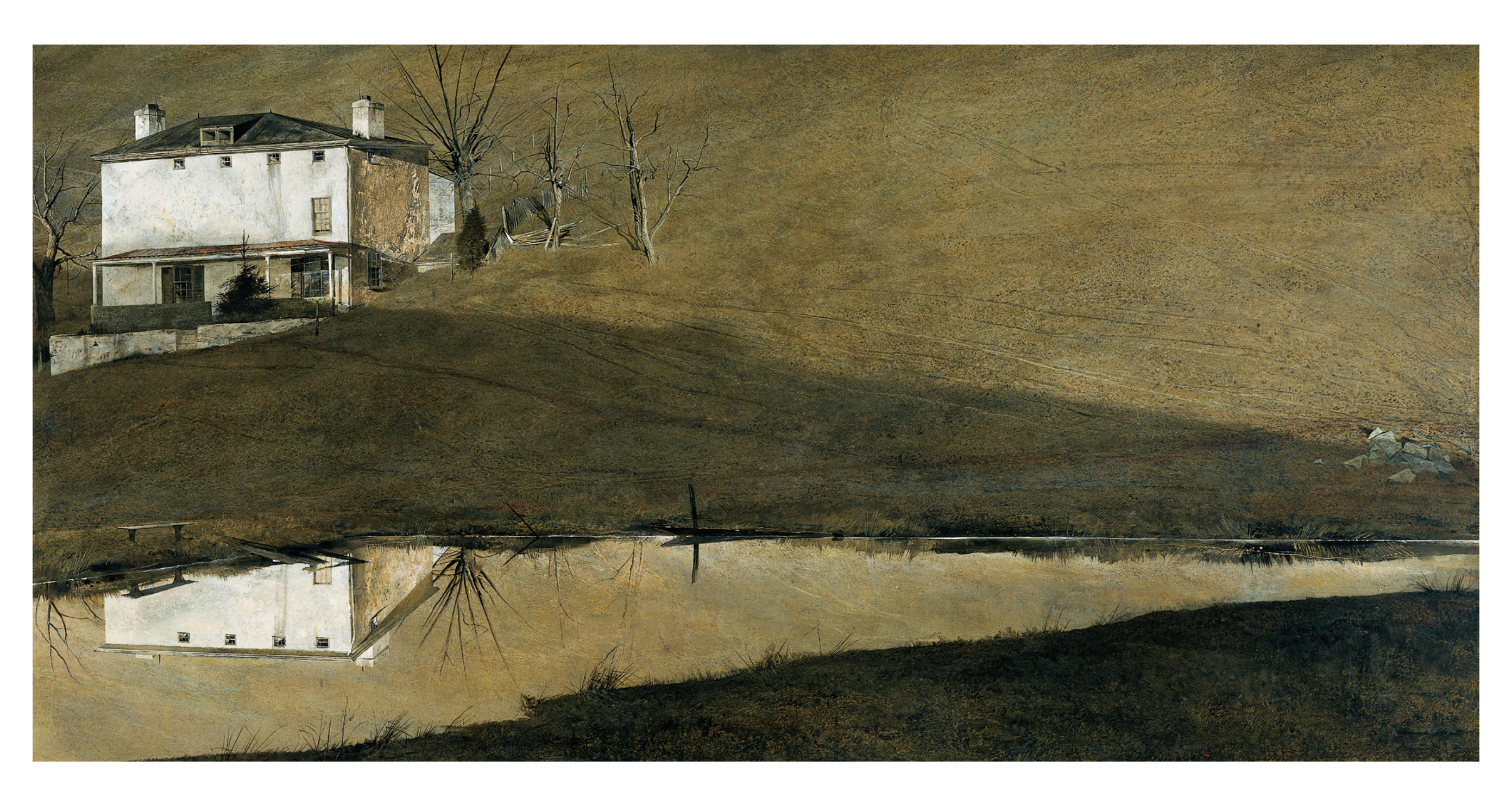
FIG. 9. Andrew Wyeth (American, 1917–2009). Brown Swiss. 1957. Tempera on panel, 30 \times 60\% " (76.2 x 152.7 cm). PRIVATE COLLECTION