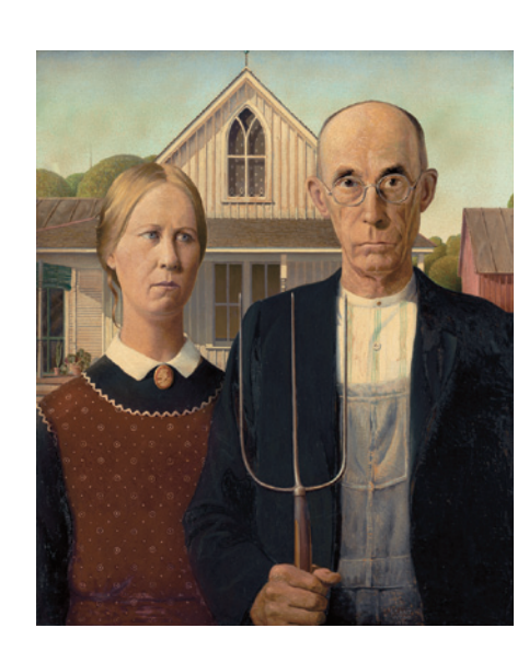
FIG. 2. Grant Wood (American, 1891–1942). American Gothic. 1930. Oil on beaver board, 30<sup>3</sup>/<sub>4</sub> x 25<sup>3</sup>/<sub>4</sub>" (78 x 65.3 cm). THE ART INSTITUTE OF CHICAGO. FRIENDS OF AMERICAN ART COLLECTION

Christina's World is a modest-sized genre scene, painted in high detail with egg tempera on board. Set in the stark, barren landscape of coastal Maine, it depicts a young woman seen from behind, wearing a pink dress and lying in a mown field. Although she reclines gracefully, her upper torso, propped on her arms, is strangely alert; her silhouette is tense, almost frozen, giving the impression that she is fixed to the ground [FIG. 3]. Stock-still she stares, perhaps with longing, perhaps with fear, at a distant farmhouse and a group of outbuildings, ancient and grayed to harmonize with the dry grass and overcast sky. The scene is familiar, even picturesque, but it is also mysterious: Who is this young woman, vulnerable but also somehow indomitable? What is she staring at, or waiting for? And why is she lying in a field?