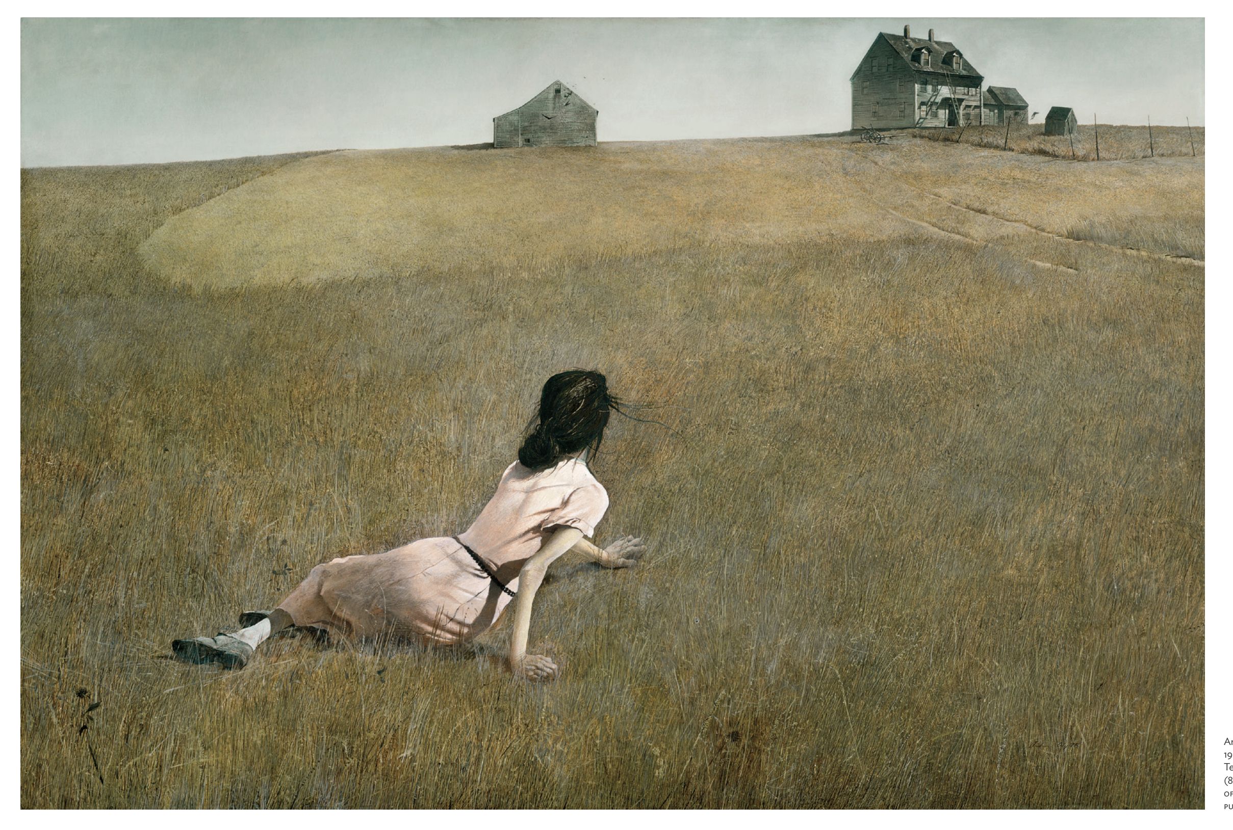
Andrew Wyeth (American, 1917–2009). Christina's World. 1948. Tempera on panel, 32½ x 47¾" (81.9 x 121.3 cm). The museum of modern art, new york. purchase, 1949