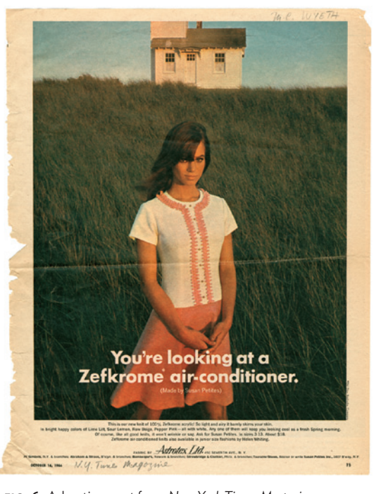
FIG. 6. Advertisement from New York Times Magazine , October 16, 1966