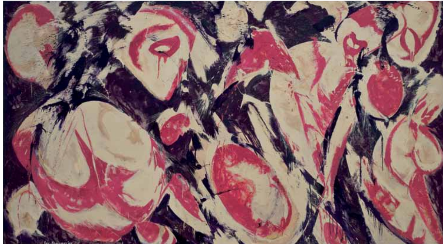
14. Lee Krasner (American, 1908–1984). Gaea . 1966. Oil on canvas, 69" x 10' 5 1/2" (175.3 x 318.8 cm). The Museum of Modern Art, New York. Kay Sage Tanguy Fund

discipline of art history developed rapidly from its initial nineteenth-century foundations in the German university, swiftly taking root in the United States in the midcentury when the first university chairs in art history were granted. The major schools of art history sought to establish methods for studying visual culture. These were dominated by concepts of art as an intelligible succession of styles placed within national cultures subject to chronological periodization. Thus around 1929, when MoMA was founded, modernist art's diversification encountered art-historical systematization ; the latter tamed the former into the story MoMA and all other modern museums and art-history textbooks have subsequently told.