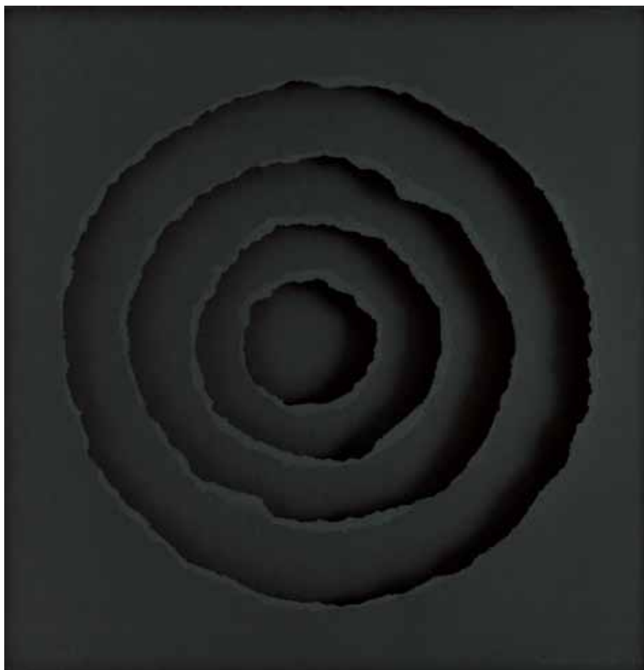
16. Anna Maria Maiolino (Brazilian, born Italy 1942). Buraco preto (Black hole) from the series Os buracos/desenhos objetos (Holes/drawing objects). 1974. Torn paper, 27 x 27" (68.6 x 68.6 cm). The Museum of Modern Art, New York. Purchase

to today. That in itself requires bold gestures of scholarly recovery, while at the same time we have to deconstruct the resulting tendency to generalize these artists as merely exemplars of a gendered collective: women, a sexualizing nomination by which they are, as a category, lumped together, their singularity annulled. As “women artists,” not artists who are women, they are excluded a priori from the category “artist,” which has been symbolically reserved for men. We must bring women together as diverse artists who share, in unpredictable ways, their experience of sexual and other significant differences, in order to see their work (because of continuing marginalization and oblivion) and in order to find out, for the first time, what in fact each woman in her artistically signified yet gendered/sexual singularity is offering to the world, to us all, to attain more complete knowledge of that world as it is lived and thought from multiple positions over time and space.