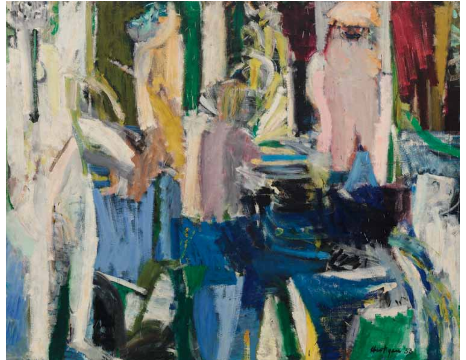
3. Grace Hartigan (American, 1922–2008). River Bathers . 1953. Oil on canvas, 69 3/8" x 7' 4 3/4" (176.2 x 225.5 cm). The Museum of Modern Art, New York. Given anonymously