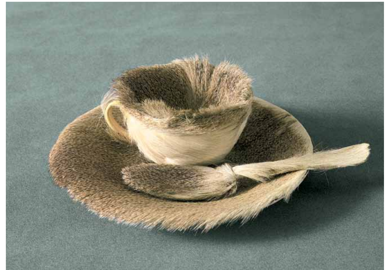
9. Meret Oppenheim (Swiss, 1913–1985). Object . Paris, 1936. Fur-covered cup, saucer, and spoon, cup 4 3 / 8 " (10.9 cm) diam., saucer 9 3 / 8 " (23.7 cm) diam., spoon 8" (20.2 cm) long, overall height 2 7 / 8 " (7.3 cm). The Museum of Modern Art, New York. Purchase