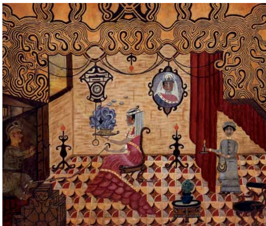
10. Josephine Joy (American, 1869–1948). Prisoner's Plea . c. 1935–37. Oil on fiberboard, 23 7/8 x 28" (60.8 x 71.0 cm). Smithsonian American Art Museum. Transfer from The Museum of Modern Art

such women could only appear as exceptions, tokens, outsiders by virtue of their gender. Furthermore, most of the more recent one-woman exhibitions at MoMA have originated at other institutions, including the Victoria and Albert Museum, London (Clementina, Lady Hawarden, 1990); the Walker Art Center, Minneapolis (Hannah Höch, 1997); The Museum of Contemporary Art, Los Angeles (Yayoi Kusama, 1998); The Art Institute of Chicago (Julia Margaret Cameron, 1999); and the Museum of Contemporary Art, Chicago (Lee