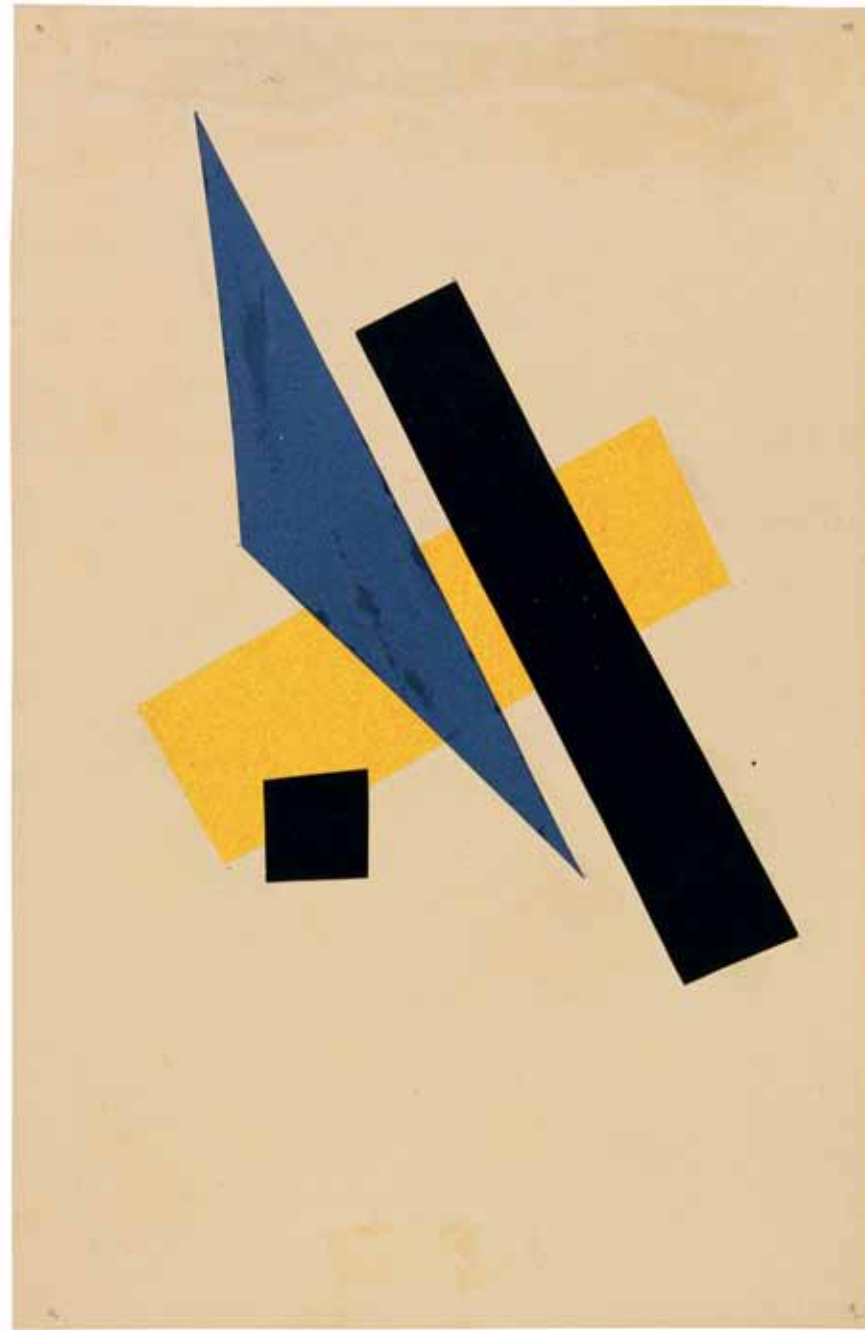
8. Lyubov Popova (Russian, 1889–1924). Untitled . 1917. Cut-and-pasted colored papers on paper mounted on board, 9 3 / 8 x 6 1 / 8 " (23.9 x 15.6 cm). The Museum of Modern Art, New York. Gift of Mr. and Mrs. Richard Deutsch