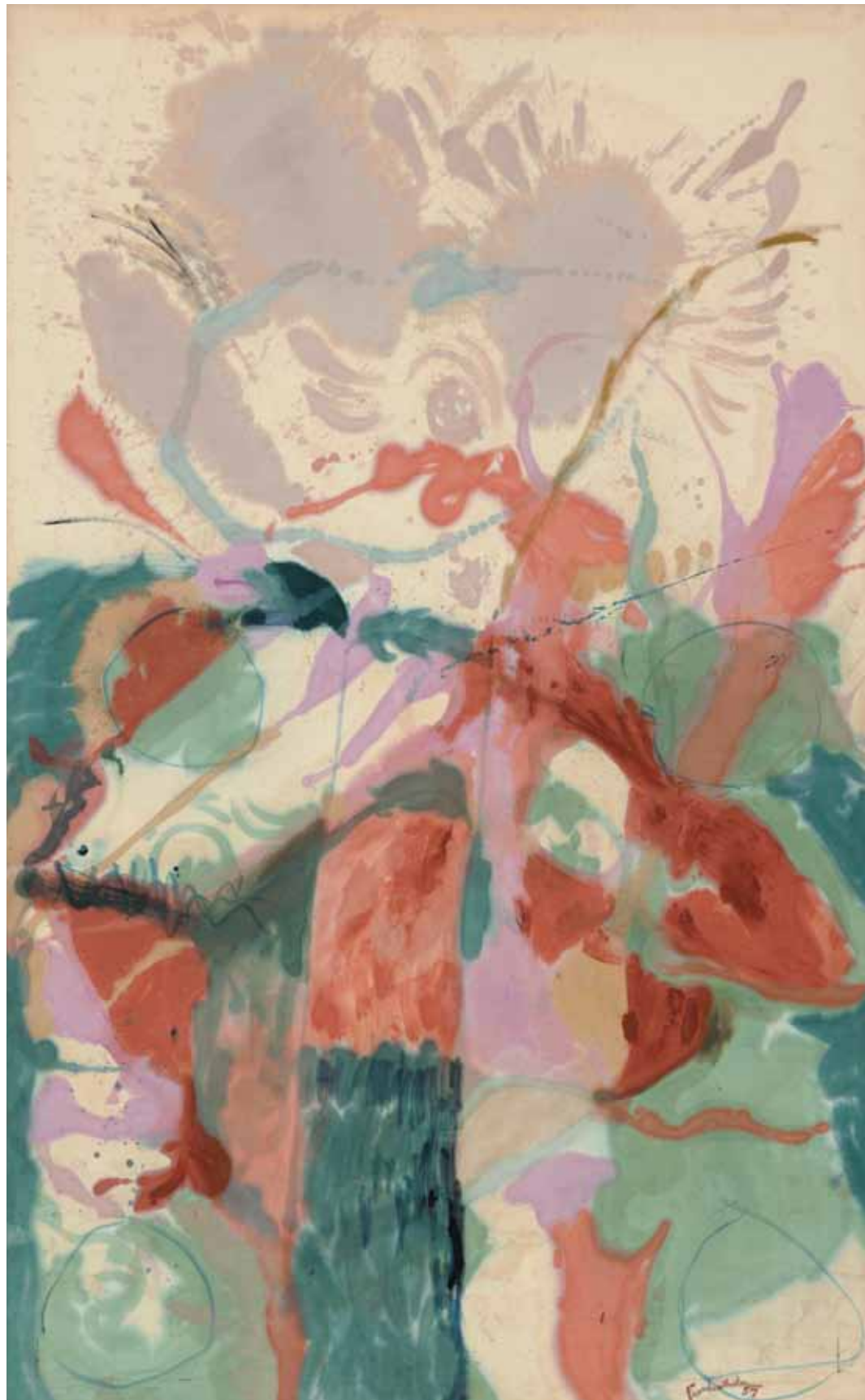
2. Helen Frankenthaler (American, born 1928). Jacob's Ladder . 1957. Oil on unprimed canvas, 9' 5 3/8" x 69 3/8" (287.9 x 177.5 cm). The Museum of Modern Art, New York. Gift of Hyman N. Glickstein