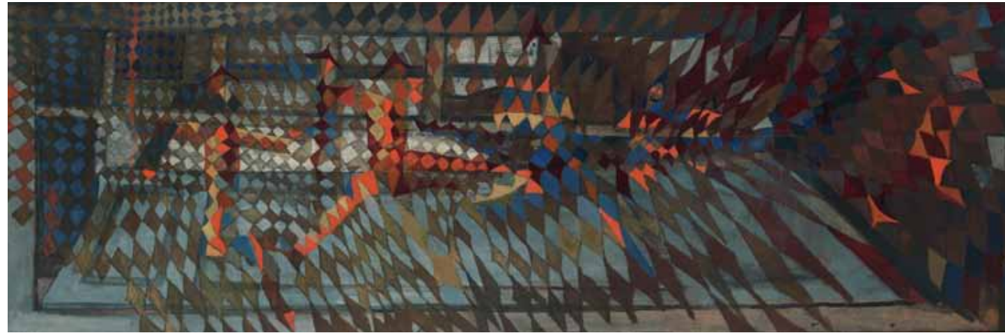
12. Maria Helena Vieira da Silva (French, born Portugal. 1908–1992). Dance . 1938. Oil and wax on canvas, 19 1/2 x 59 1/4" (49.5 x 150.5 cm). The Museum of Modern Art, New York. Alfred Flechtheim Fund