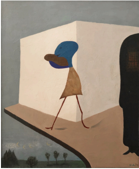
Little Ghost Eating Bread Meret Oppenheim

Look closely at Little Ghost, and draw or write what might happen next.