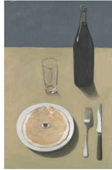
The Portrait René Magritte

Look closely at Little Ghost, and draw or write what might happen next.