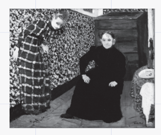
Édouard Vuillard. Interior, Mother and Sister of the Artist. 1893