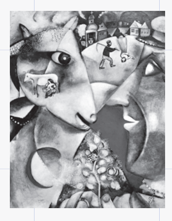
Marc Chagall. I and the Village. 1911

After serving as a medic in World War I, Max Beckmann (1884–1950) transformed his artistic style to incorporate altered perspective and proportion. In contrast to popular trends, he rejected abstract painting and embraced traditional subject matter such as portraits, still lifes, and genre scenes. In Family Picture , Beckmann paints a typical genre scene of the various stages of life, ranging from infancy to old age, within one family. The relationships of the figures, however, remain ambiguous.