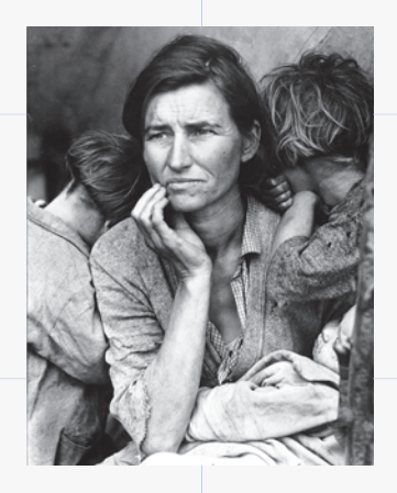
Dorothea Lange. Migrant Mother, Nipomo, California. 1936

The majority of paintings by Édouard Vuillard (1868–1940) depict domestic interiors and public scenes. They are often rendered with an overall blurred quality, with different textures and patterns blending into each other. Vuillard's mother earned a living for her family as a dressmaker. The influence of her profession can be seen in Vuillard's inclusion of intricate decorative patterns. In Interior, Mother and Sister of the Artist , he incorporates these patterns throughout the domestic space, seen not only on the clothing of his sister (the figure on the left) but also on the wallpaper. The mother anchors the composition, with the walls and floor all angling in toward her seated figure.